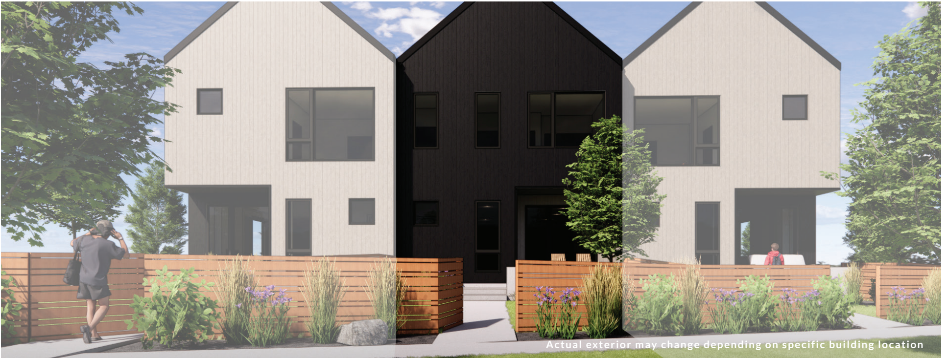
Actual exterior may change depending on specific building location

\fee-kah\ Swedish: Making time for friends and colleagues to share a cup of coffee (or tea) and a little something to eat.